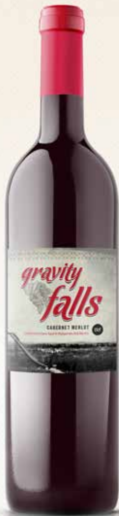
4 Why Great Packaging Matters