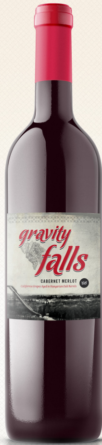
4 Why Great Packaging Matters